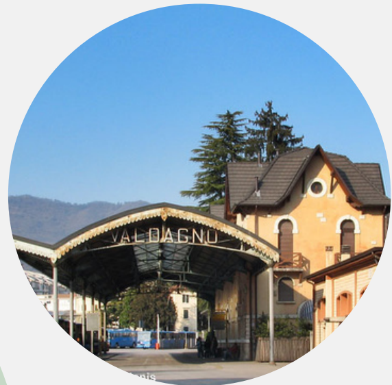
Valdagno bus station

The hotel Isola is in Via Campogrosso 35 , so just walk 600m straight ahead and you will find your accommodation.