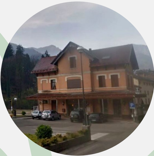
Recoaro bus station

Once you are already on board, after 1 hour you should be in Valdagno , it means that you are getting closer to Recoaro (15 more minutes) , so keep your eyes open.